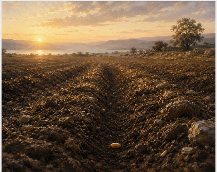
What kind of soil are you?